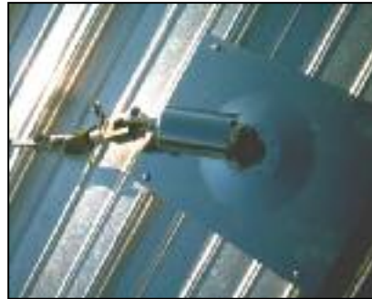
After A Dynamic Performance Test

In order to accurately predict the performance of the fall arrest system, dynamic performance analysis software should be used in conjunction with the results of testing and an understanding of the limitation of the roof structure to which the system is to be fixed. This should include an understanding of how the load distributed by the roof anchor will affect the entire structure of the roof, not just the top sheet.