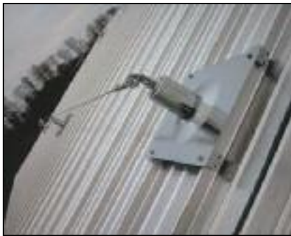
Standing Seam Clamp Fixing Pre Test

Conducting this type of testing requires significant commitment from the safety equipment manufacturer, but ensures that the end customer is provided with a safety product that will perform when it is required to do so, without catastrophic failure of the roof system. A good system should be able to reduce the overturning moment on the roof system and reduce the loading to an acceptable level.